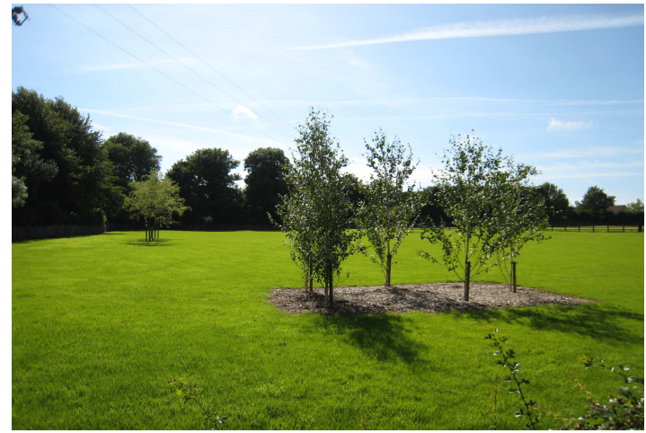
View from rear garden

Directions From Shepton Mallet proceed along the A37 to Bristol/Bath then turn right on the A365 towards Bath/Oakhill. Turn left into Oakhill high street then first right into Zion Hill. Tall Timbers can be found approx 450 yards on the left just before pound lane.